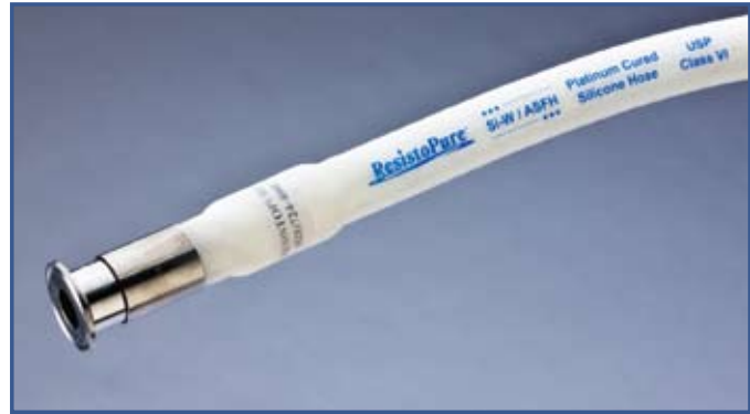
*Shown with optional encapsulated tagging