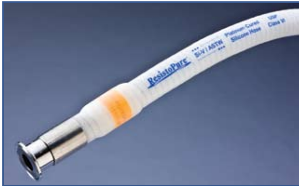
*Shown with optional encapsulated tagging