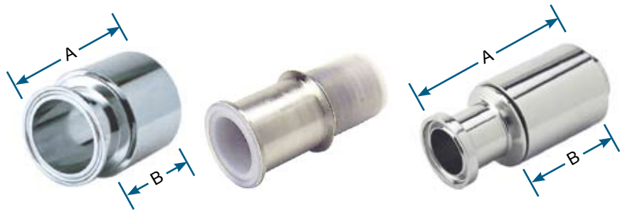
Tri-Clamp® Style # 50 or 54

316 Stainless Steel Teflon® PFA Encapsulated Kynar® See page 38