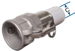
Female Encapsulated Style # 78 E or 78 A