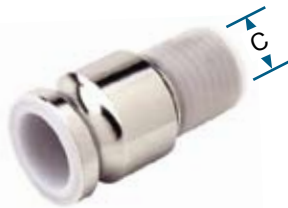
Male Encapsulated Style # 70 E or 70 A