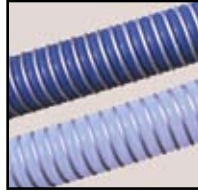
Wire wrap available See page 9