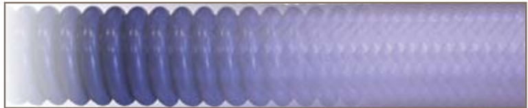
(conductive liner shown)